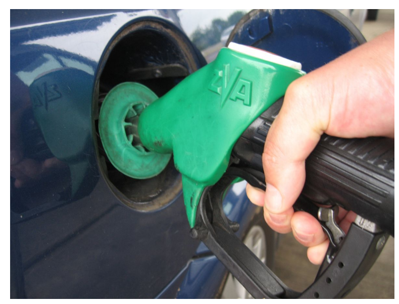
Smarter driving will help you get more miles from each tank of petrol

Smarter driving could save you the equivalent of about one month's worth of fuel a year. It will also help you drive safely and reduce wear and tear on your clutch and gearbox. For more money saving tips and information on travelling with lower carbon emissions, contact the Energy Saving Trust on 0800 512 012 .